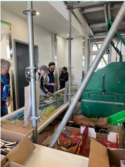
Arranging the tiles again on tables at the Bathhouse