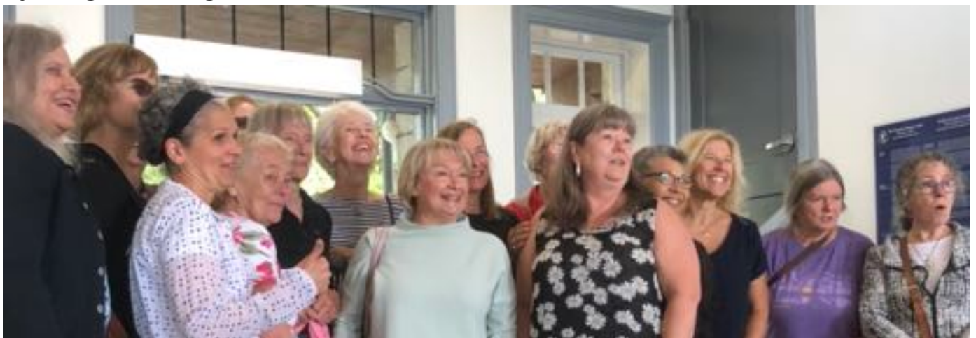
Lots of smiles on dedication day!