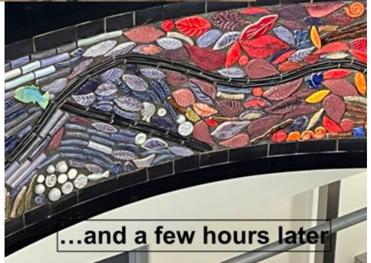
At the end of day 3 things were starting to move along